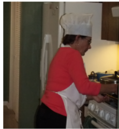
Chef at work